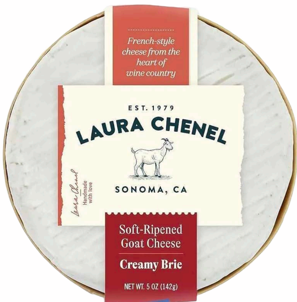
Laura Chenel Goat Brie 5 oz