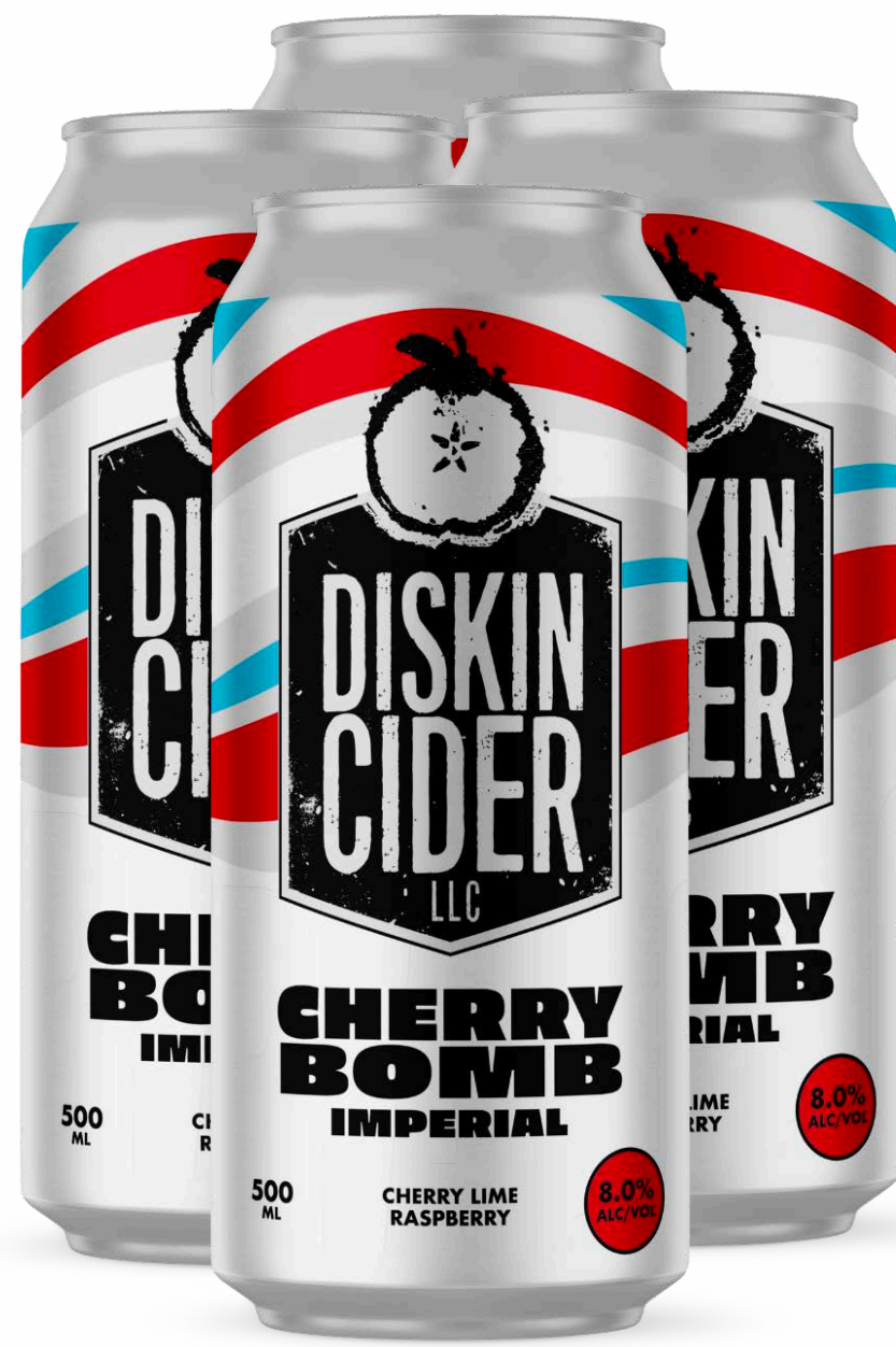
Diskin Cider IMP Cherry Bomb 4 pk / 16 oz