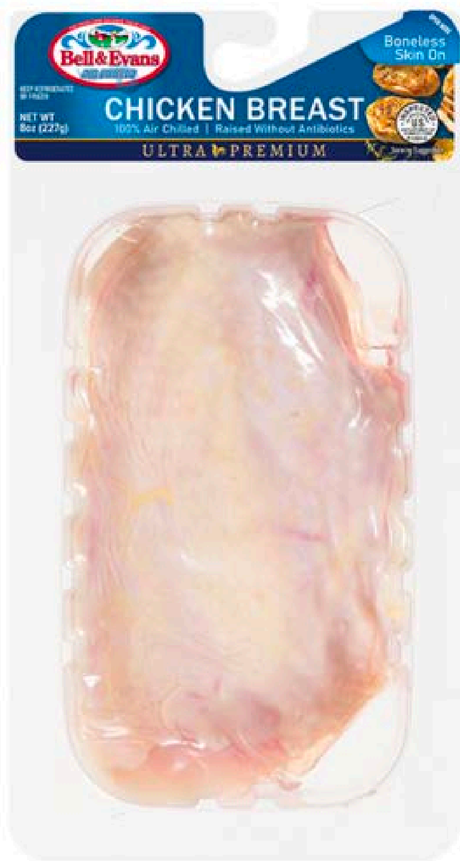
Bell & Evans Single Serve Chicken Breast 6 oz

Their farm-to-table approach prioritizes animal welfare and food integrity. Bell & Evans delivers poultry you can feel good about feeding your family.