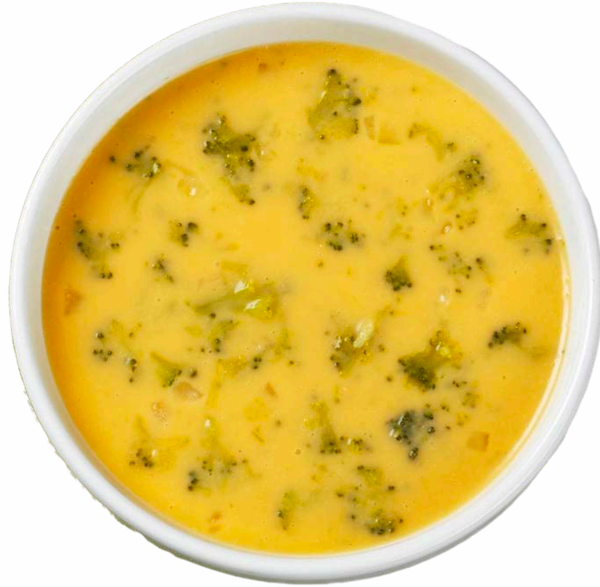
Kettle Cuisine Broccoli Cheddar Soup 32 oz