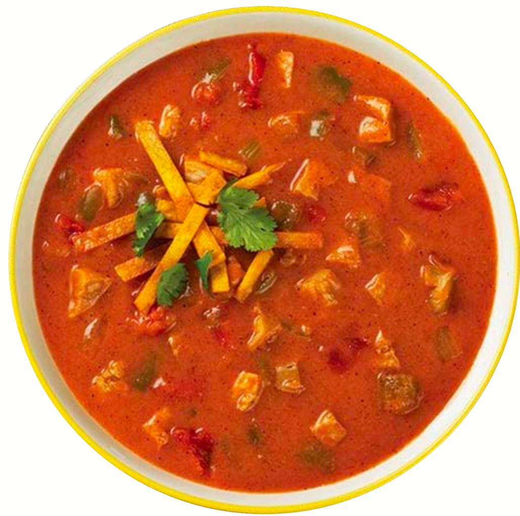
Kettle Cuisine Chicken Tortilla Soup 32 oz