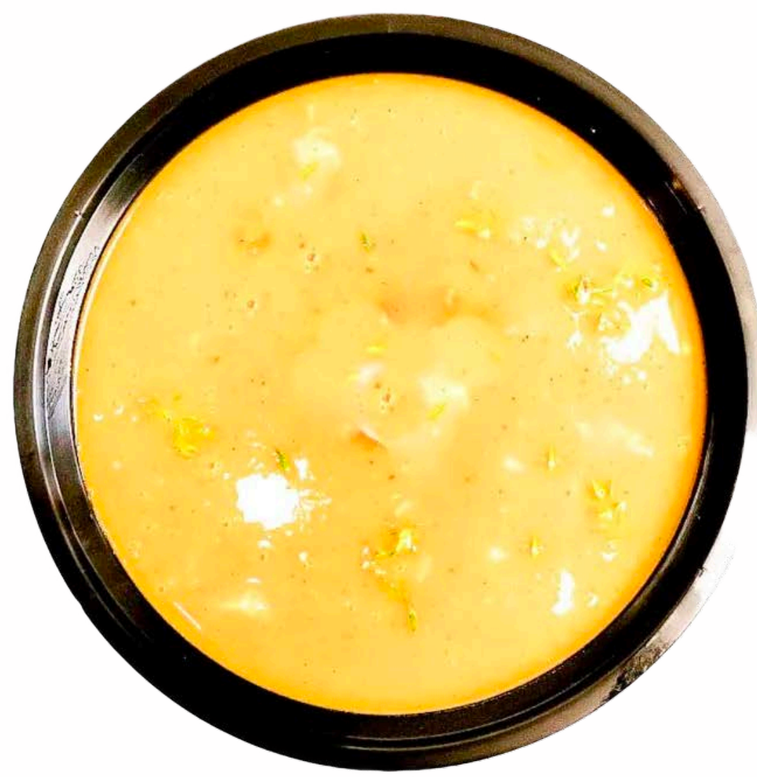
Kettle Cuisine Apple Butternut Squash Soup 32 oz

Today, they continue to craft soups that comfort and nourish, from classics to globally inspired flavors. Every bowl tastes like it was made from scratch in your own kitchen.