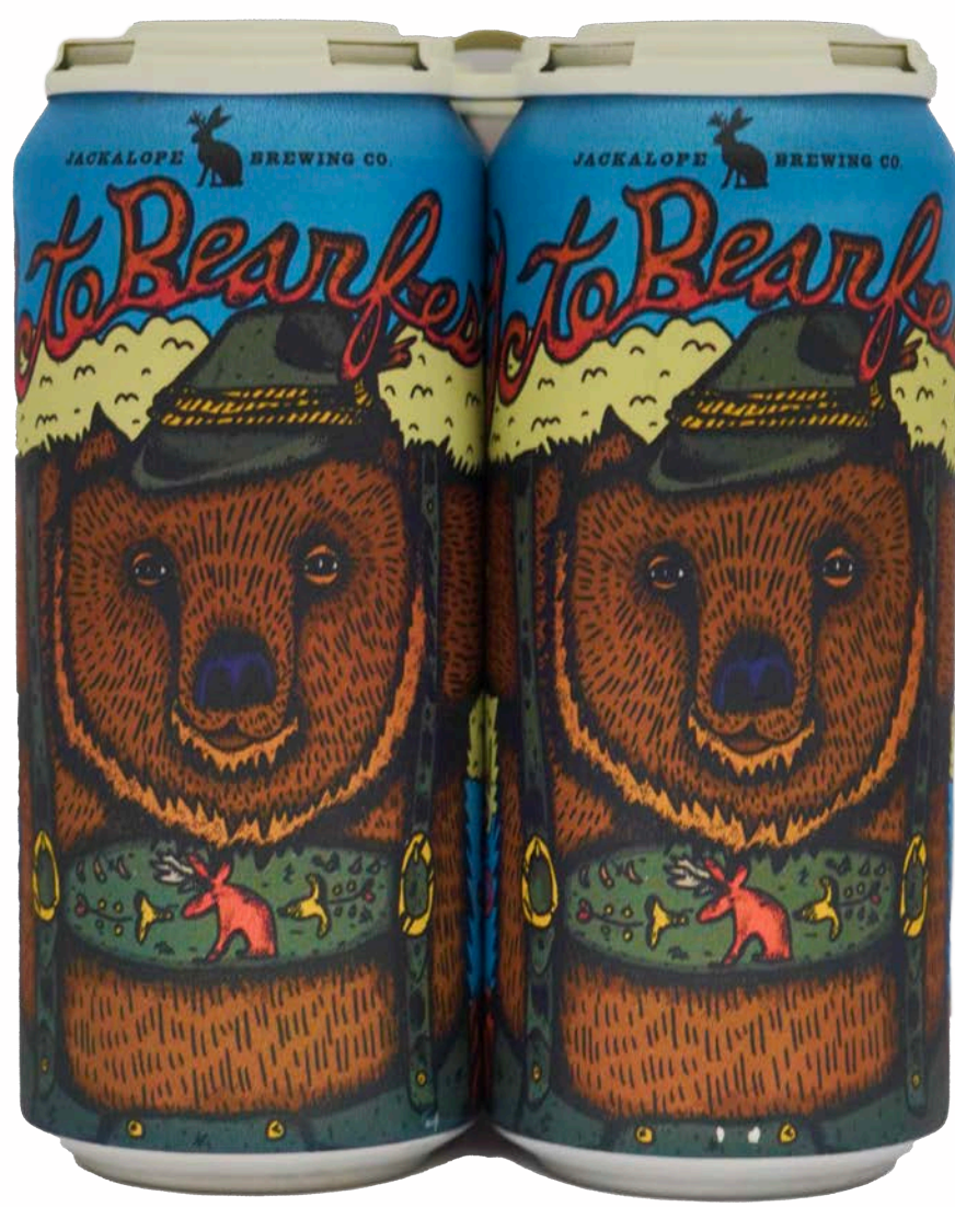
Jackalope Octobearfest 4 pk / 16 oz